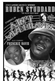
Ain't Misbehavin' April 18