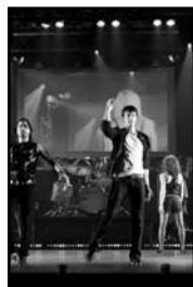
Revolution Oct. 3