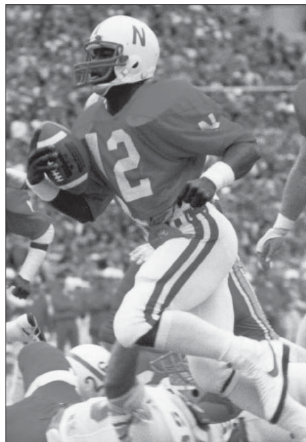
Turner Gill led Nebraska's "Scoring Explosion" to the highest scoring season in NCAA history. Featuring Heisman Trophy winning I-back Mike Rozier and wide receiver Irving Fryar, the No. 1 overall pick in the NFL Draft, the Huskers scored 624 points in 1983.

High Yards: 4,820; 1983 (724 att.) Low Yards: 918; 1947 (315 att.) High Yards Per Game: 401.7; 1983 (4,820 yards/12 games) Low Yards Per Game: 96.0; 2005 (1,152 yards/12 games) High Attempts: 762; 1982 (4,732 yards) Low Attempts: 315; 1947 (918 yards) High Yards Per Attempt: 7.01; 1995 (4,398 yards/627 att.) Low Yards Per Attempt: 2.57; 1958 (1,135 yards/442 att.) High Yards Lost: 580; 1951 Low Yards Lost: 157; 1974 Touchdowns: 66; 1983, 1997 (Low: 3; 1958)