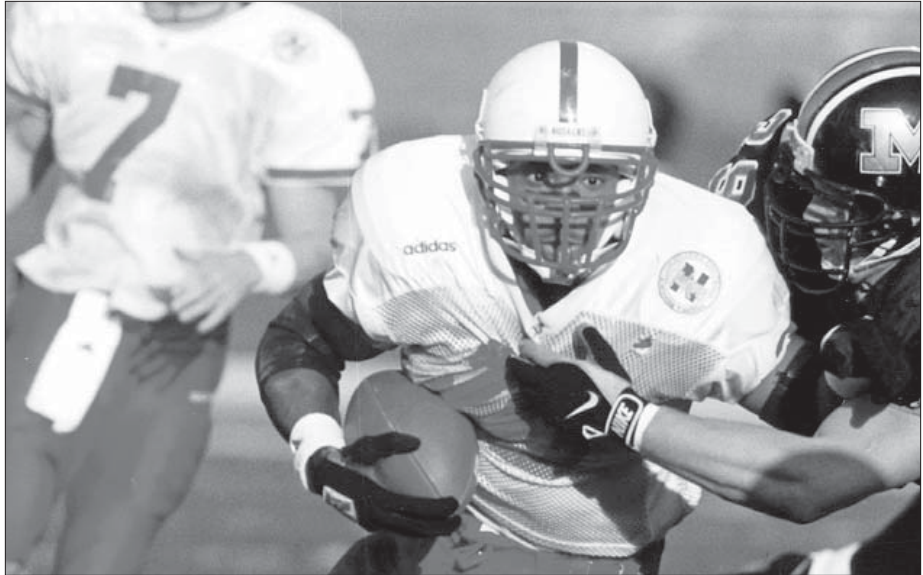
Ahman Green owns Nebraska's freshman record for all-purpose yardage with 1,259 yards in 1995. Green ranks third in Husker history with 4,280 career all-purpose yards.