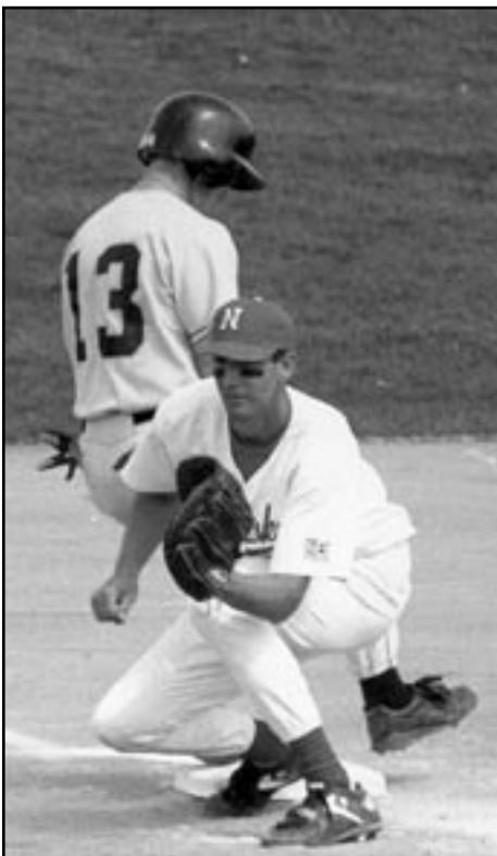
Current San Diego Padre Todd Sears holds the school record for most putouts with 1,375 from 1995 to 1997.