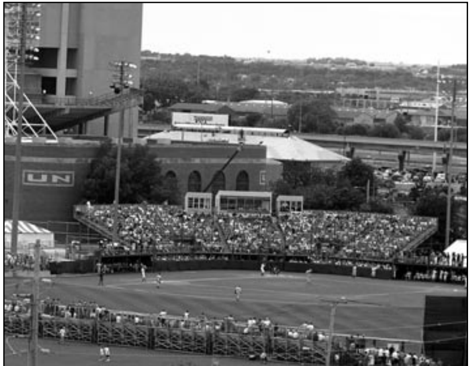
Buck Beltzer Stadium was the home of Husker baseball from 1979 to 2001. NU went 527-137 at "The Buck," while a record crowd of 5,484 saw Nebraska's 9-6, 10-inning win over Rice on June 1, 2001, clinching NU's first CWS appearance.