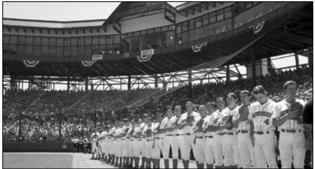
The Huskers reached the College World Series for the first time in 2001 and finished with a 50-16 record. The 50 wins is the second-highest total in school history, trailing only the 2000 club that won 51 games and reached the first Super Regional in NU history.