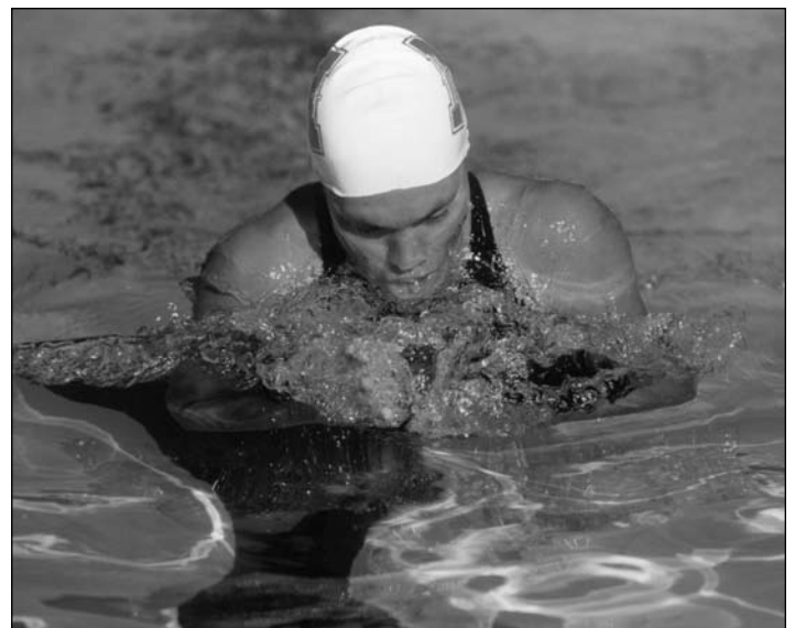
Olympic gold medalist Penny Heyns became the first Husker to win a national championship in 1996.

As Heyns begins another chapter in her storybook career, you can bet that this golden Penny will continue to shine well into the 21st century.