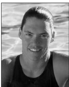
PENNY HEYNS (SOUTH AFRICA) 1992, 1996, 2000