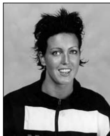
THERESE ALSHAMMAR (SWEDEN) 1996, 2000, 2004, 2008

A four-time Olympian, Therese Alshammar lettered for the Huskers in 1998 and 1999. Considered one of the top female freestyle sprinters in the world, Alshammar set two records at the 2000 European Short Course Championships. Alshammar took home three medals from the Sydney Olympics, a pair of silvers and a bronze.