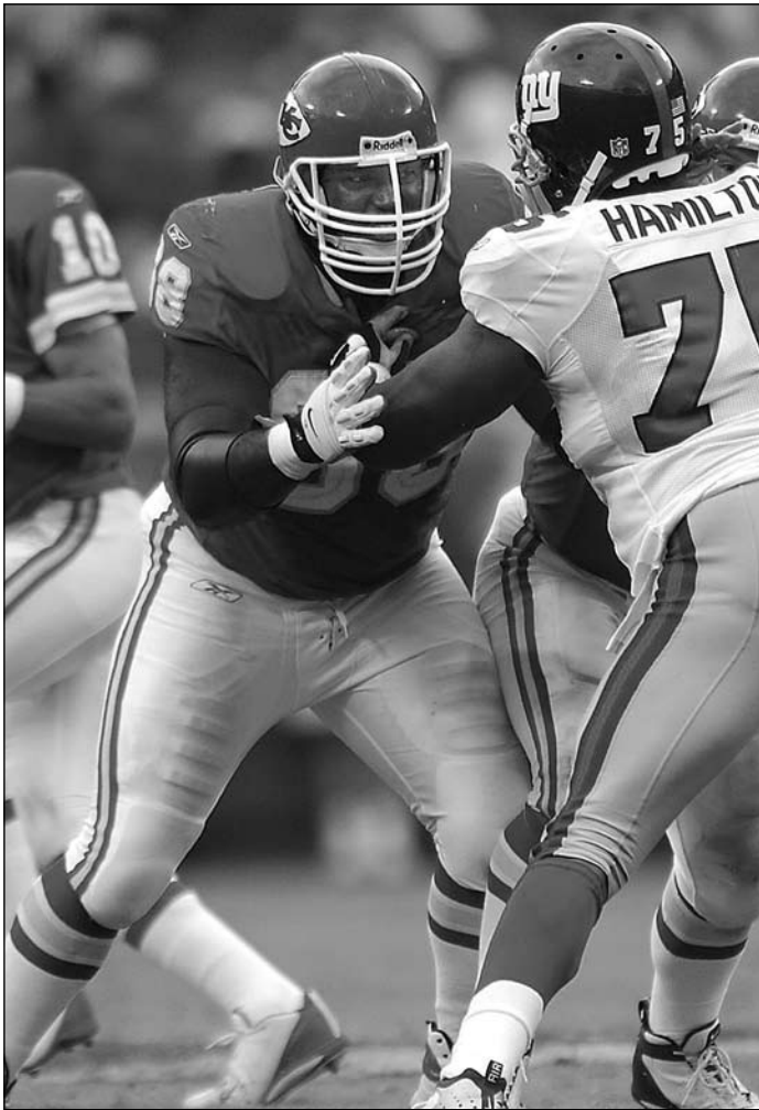
In his 14 years with the Kansas City Chiefs, 1992 Outland Trophy winner Will Shields earned 11 trips to the Pro Bowl. Shields, who helped the Huskers to three NCAA rushing titles during his All-America career, was a third-round draft pick by the Chiefs in 1993 and started more than 200 consecutive games for Kansas City before retiring after the 2006 season.