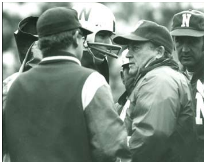
Bob Devaney guided Nebraska to back-to-back national titles in 1970 and 1971. Devaney remains the 11th-winningest coach in Division I-A history, posting an .806 winning percentage in 16 years as a collegiate head coach, including a 101-20-2 (.829) record from 1962 to 1972 at Nebraska.