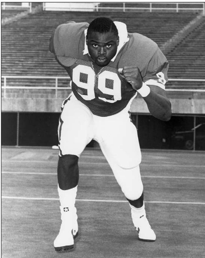
Defensive tackle Neil Smith claimed All-America honors for the Huskers in 1987, playing under Coach Tom Osborne. Smith was inducted into the Nebraska Football Hall of Fame in 1998.