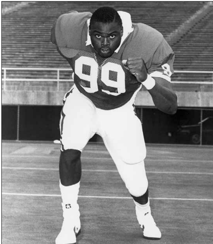
Defensive tackle Neil Smith claimed All-America honors for the Huskers in 1987, playing under Coach Tom Osborne. Smith was inducted into the Nebraska Football Hall of Fame in 1998.