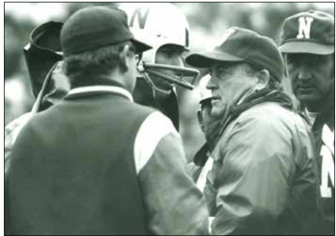
Bob Devaney guided Nebraska to back-to-back national titles in 1970 and 1971. Devaney remains one of the winningest coaches in Division I-A history, posting an .806 winning percentage in 16 years as a collegiate head coach, including a 101-20-2 (.829) record from 1962 to 1972 at Nebraska.