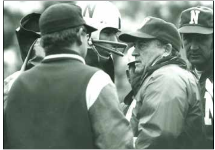
Bob Devaney guided Nebraska to back-to-back national titles in 1970 and 1971. Devaney remains one of the winningest coaches in Division I-A history, posting an .806 winning percentage in 16 years as a collegiate head coach, including a 101-20-2 (.829) record from 1962 to 1972 at Nebraska.