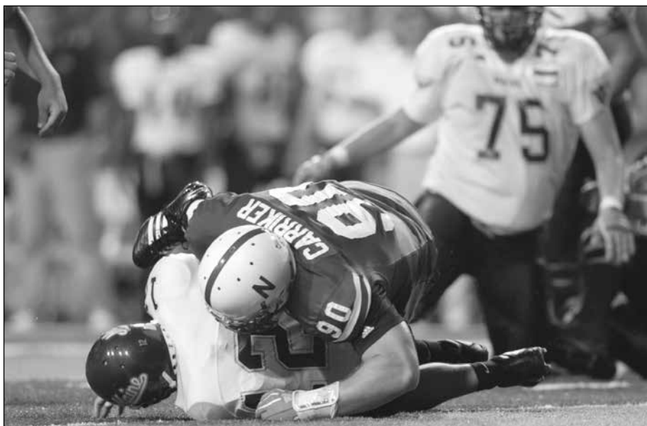
Nebraska tied a school record with 18 tackles for loss in the 2005 season-opening victory over the Maine Black Bears at Memorial Stadium. The 89 yards lost by the Black Bears tied for fifth in the school record book.

High Interception Return Touchdowns: 5; 1971; 1995