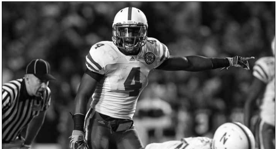
Lavonte David broke the Nebraska school record for tackles in a season with 152 total stops in 2010. David also broke the season record for pass breakups by a linebacker with 10.

High Penalties, Game: 16; at Texas A&M, Nov. 20, 2010 (145 yards) Low Penalties, Game: 0; several times, most recently vs. Maine, Sept. 3, 2005 High Penalty Yards, Game: 145; at Texas A&M, Nov. 20, 2010 (16 penalties) Low Penalty Yards, Game: 0; several times, most recently vs. Maine, Sept. 3, 2005 High Penalties, Season: 109, 2010 (993 yards) Low Penalties, Season: 33; 1960 (324 yards) High Penalty Yards, Season: 993; 2010 (109 penalties) Low Penalty Yards, Season: 256; 1957 (36 penalties)