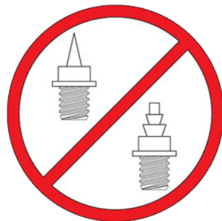
Damaging Steel Spikes